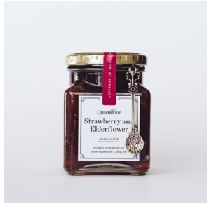
Strawberry & Elderflower Jam 260ml | 280g Net

A heavenly blend of ripe strawberries and delicate elderflower blooms. Versatile and artisan-crafted, it strikes the ideal balance between vibrant sweetness and subtle floral notes.