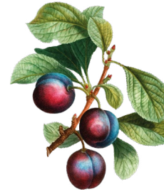
Blueberry & Chia Jam 260ml | 295g Net

At the heart of our jam lies the mighty chia seed – a nutritional powerhouse revered for its health benefits. These tiny seeds are packed with omega-3 fatty acids, antioxidants, fiber, and essential minerals. As they absorb liquid, chia seeds also contribute to the delightful texture and thickness of our jam, ensuring a satisfying spread with every bite.