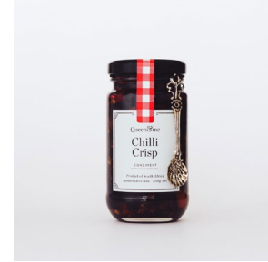
Chili Crisp 125ml

Embrace the thrill of bold flavors and fiery heat with our Chili Crisp Condiment—a must-have for spice enthusiasts and flavor seekers alike.