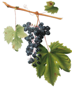
Onion & Balsamic 260ml | 290g Net

Bursting with the sweet tanginess of caramelized onions and the rich depth of aged balsamic vinegar, this marmalade offers a symphony of flavors in every spoonful.