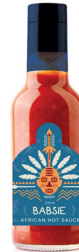
Babsie African Hot Sauce 125ml

Experience the fiery essence of a hot sauce recipe, born from the creativity and passion of our domestic.