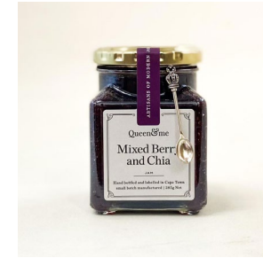
Mixed Berry & Chia Jam 260ml | 295g Net

At the heart of our jam lies the mighty chia seed – a nutritional powerhouse revered for its health benefits. These tiny seeds are packed with omega-3 fatty acids, antioxidants, fiber, and essential minerals. As they absorb liquid, chia seeds also contribute to the delightful texture and thickness of our jam, ensuring a satisfying spread with every bite.