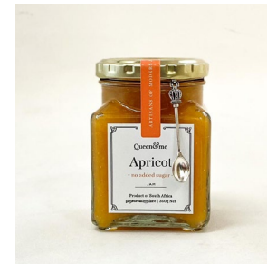
No Added Sugar - Apricot 260ml | 295g Net

Low in calories and carbs, with absolutely no added sugar at all.