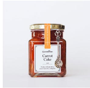
Carrot Cake Jam 260ml | 290g Net

A classic dessert condensed into a delightful spread for your everyday indulgence! Crafted with care and precision, our Carrot Cake Jam is a symphony of sweet carrots, aromatic spices, and hints of vanilla & caramel.