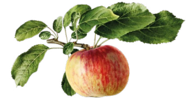
Sweet Mustard 260ml | 290g Net

Adelectable blend of tangy mustard seeds and natural sweetness that adds a burst of flavor to any dish.