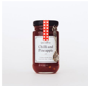
Chili & Pineapple Jam 125ml

Embark on a flavor adventure with our Tropical Heatwave Pineapple & Chili Jam, a tantalizing blend of sweet pineapple and spicy chili that ignites the taste buds and transports you to sun-drenched shores with every bite.