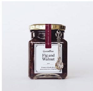
Fig & Walnut Jam 260ml | 295g Net

Embark on a culinary journey through the vibrant flavors of the harvest season with our Spiced Fig & Walnut Jam, a tantalizing blend of rich figs, crunchy walnuts, and warm spices.