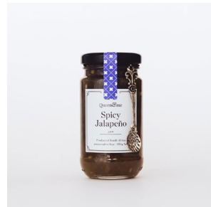
Spicy Jalapeno Jam 125ml

Embark on a flavor adventure with our Tropical Heatwave Pineapple & Chili Jam, a tantalizing blend of sweet pineapple and spicy chili that ignites the taste buds and transports you to sun-drenched shores with every bite.