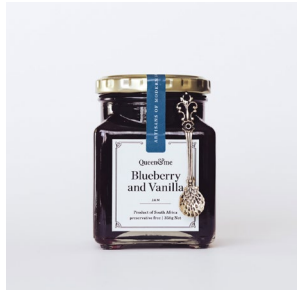
Blueberry and Vanilla Jam 260ml | 290g Net

Let the intoxicating aroma of blueberries and vanilla envelop you in a blanket of comfort and joy as you savor the simple pleasures of life.