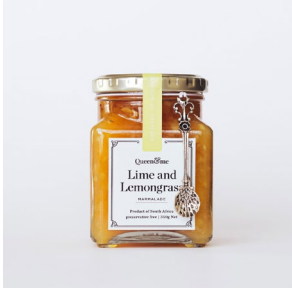
Lime & Lemongrass 260ml | 280g Net

Transport your taste buds to sun-drenched groves with our Lime & Lemongrass, a tantalizing blend of zesty citrus and aromatic lemongrass..