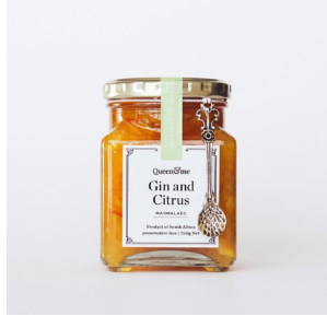
Gin & Citrus 260ml | 290g Net

Handpicked citrus fruits are meticulously sliced and simmered to perfection, capturing the vibrant essence of the orchard and subtle botanical notes of gin.