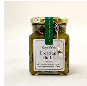
Bread & Butter Pickles 260ml | 290g Net

A delightful blend of crispiness, tanginess, and sweetness that will tantalize your taste buds.